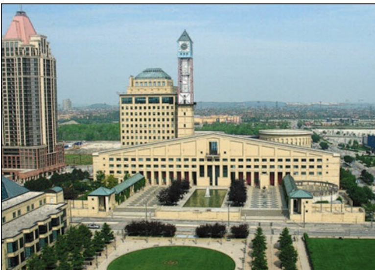
Mississauga City Hall

Pearson International Airport, Canada's busiest, is located in Mississauga and the GTA is one of the biggest employers in the city. Mississauga is also home to a number of drug and manufacturing companies, and many high-tech and financial institutions have their head offices in the city. The largest employers in the city include Accenture, Air Canada, Bell Canada, Canada Cartage, Canada Post, Canada Revenue, Candu Energy, Citi, Federal Express, Hewlett-Packard, Maple Leaf Consumer Foods, Microsoft, Novartis, RBC Financial Group, Suncor Energy, Symcor Inc., TD Bank Financial Group, the Trillium Health Partners, Target Canada, General Electric and Walmart Stores Corp.