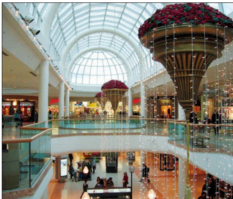
Square One Shopping Centre

Each of the villages that now make up Mississauga has lovely boutique-style shopping with cafés and restaurants to suit every taste and budget. Square One Shopping Centre, located at the City Centre, has over 350 stores and services and is surrounded by several bars and restaurants, a multi-screen movie theatre, City Hall, the Central Library and Playdium. The Erin Mills Town Centre is the second-largest mall in the city and is notable for its clock tower, mini-golf course and daycare centre. The Dixie Outlet Mall — the city's first indoor shopping centre — is home to premium brand outlets and the Fantastic Flea Market.