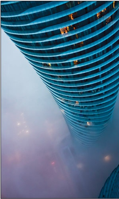
The Absolute Towers, also known as the Marilyn Monroe buildings.