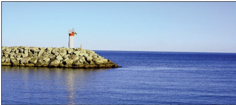
Port Credit Lighthouse

Mississauga boasts more than 522 parks and 225 kilometres of trails and woodlands. Some parks provide serenity, while others boast a variety of active recreational facilities, including indoor and outdoor skating rinks, cricket and soccer pitches, baseball and softball diamonds, football fields, tennis courts and childrens' play areas and splash pads. Mississauga is also home to successful athletes and boasts world-class synchronized swimming and rowing clubs, in addition to canoeing, soccer and figure skating clubs. Indoor playgrounds include Playdium, Kids Time Family Fun Centre, KidSports and the Laser Quest Centre. There are many golf courses in the city, including Derrydale, Credit Valley, Toronto Golf, Streetsville Glen, Lionhead, Grand Highland, Mississauga Golf, BraeBen and Lakeview.