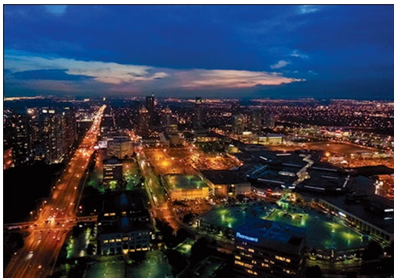
Mississauga's City Centre skyline at night.

Mosaic Festival, which is the largest South Asian multi-disciplinary arts festival in North America. Streetsville holds its annual Bread and Honey Festival the first weekend of June and Port Credit holds multiple festivals throughout the year, including Buskerfest, the Waterfront Festival, and the Southside Shuffle Blues & Jazz Festival. In Malton, the Sikh community holds its annual Khalsa Day Parade, which attracts more than 100,000 people.