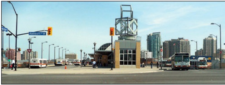
Mississauga Transit terminal at Square One.